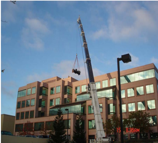
320 Ton SMARTD chiller being lowered by crane for installation in the Urban West Business Park Building, Walnut Creek, California

Modular, split shell, and vibration free designs, facilitate installation and eliminate vibration isolation requirements. SMARTD chillers have the lowest noise levels in their class, utilize advanced controls software, and are code compliant.